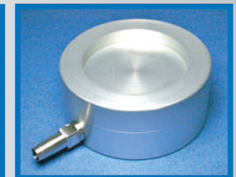
28.3 LPM (Clear)