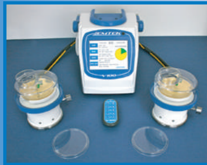
V100 & R2S Dual @ 50 LPM

The V100 can operate two (2) R2S or RAS samplers at the same time at a sampling rates of 50 LPM, and four (4) R2S or RAS samplers at 28.3 LPM. Ask your sales representative for details.