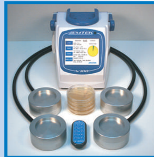
V100 & 4 x RAS @ 28.3 LPM