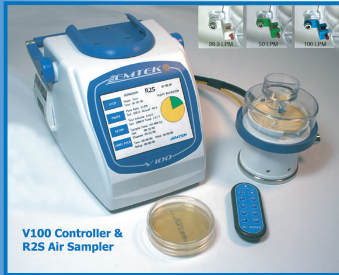
V100 Controller & R2S Air Sampler